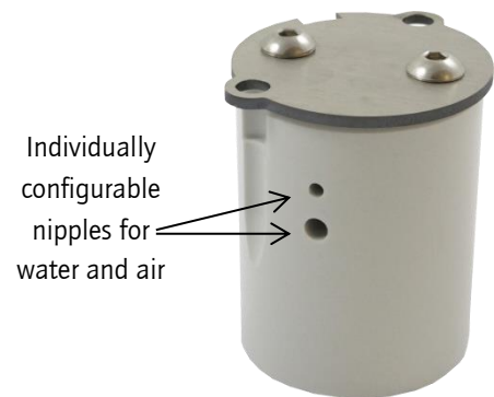
Medtronic water bottle receptacle for ADEC® bottle system