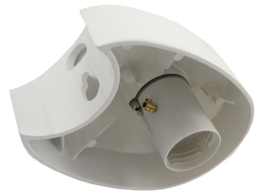
Easy mounting to an existing ADEC® bottle system